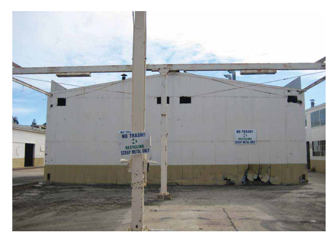
Building 169 - Pattern Staging Building, North Elevation, San Diego, California, October 2009.