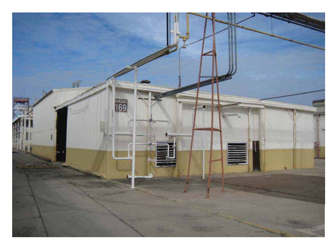
Building 169 - Pattern Staging Building, Southwest Oblique, San Diego, California, October 2009.