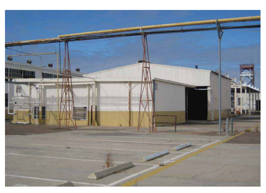
Building 169 - Pattern Staging Building, Southeast Oblique, San Diego, California, October 2009.