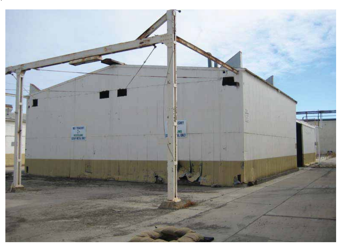
Building 169 - Pattern Staging Building, Northeast Oblique, San Diego, California, October 2009.