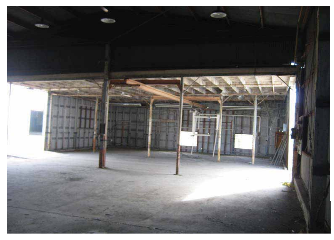
Building 169 - Pattern Staging Building, Interior Northwest Oblique, San Diego, California, October 2009.