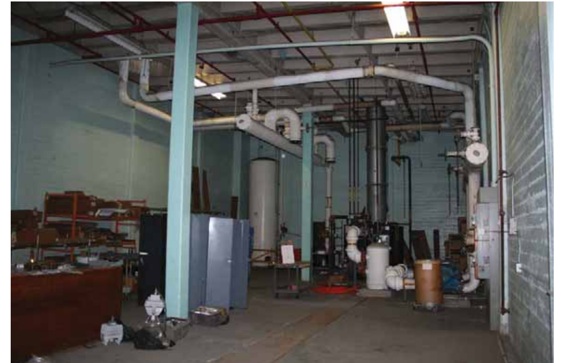
Building 147 - Ancillary Building Interior, facing North, San Diego, California, October 2009.