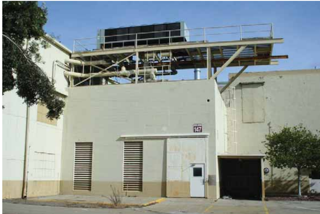
Building 147 - Ancillary Building, South Elevation, San Diego, California, October 2009.