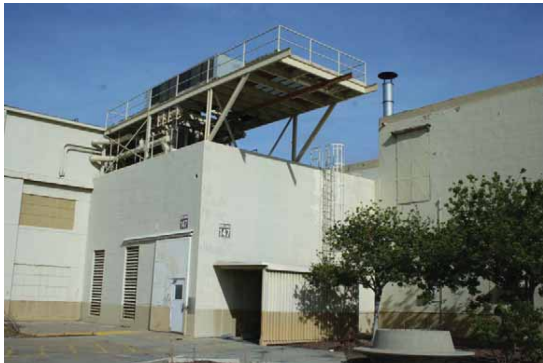
Building 147 - Ancillary Building, Southeast Oblique, San Diego, California, October 2009.