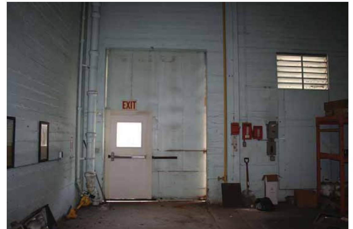
Building 147 - Ancillary Building Interior, facing South, door detail, San Diego, California, October 2009.